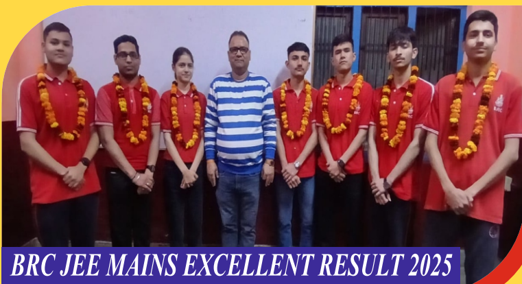
BRC JEE MAINS EXCELLENT RESULT 2025

Imparting valueable education is our mission. Let us Contribute together in accomplishing the vision. Your Caliber will surely decide your fate. We are here to lead you towards that gate.